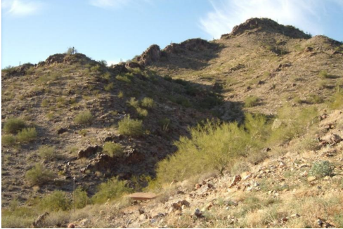
Lot 4 | $1,225,000 | 3.00 acres