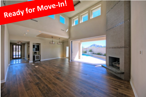
3965 E Sierra Vista Dr - $1,995,000 5 bed | 5.5 bath | 4683 SF