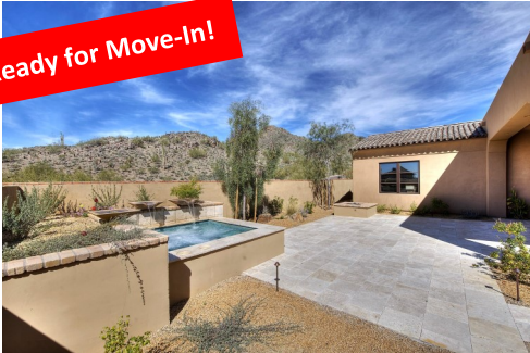
6620 N 39th Way - $1,695,000 3 bed | 3.5 bath | 3202 SF