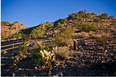
Lot 5 | $ 775,000 | 2.98 acres