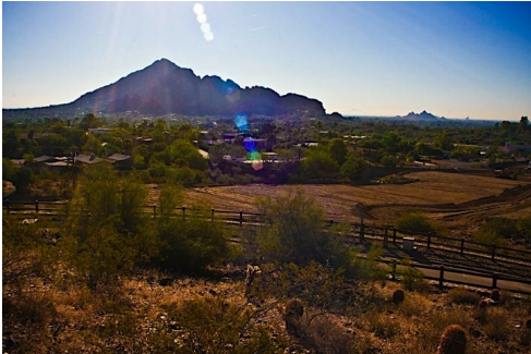
Lot 7 | $650,000 | 1.04 acres