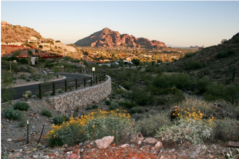
Lot 9 | $700,000 | 3.02 acres