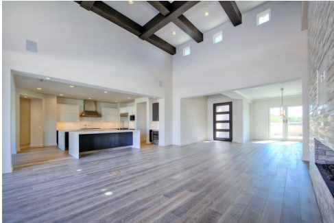
6575 N 39th Way - $2,000,000 4 bed | 4.5 bath | 3844 SF

View these properties and all of our listings and sales at www.ArizonaFineProperty.com