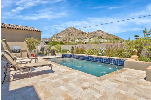
6715 N 39th Way - $1,850,000 4 bed | 4.5 bath | 3892 SF