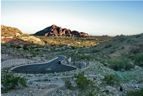
Lot 14 | $1,095,000 | 1.67 acres