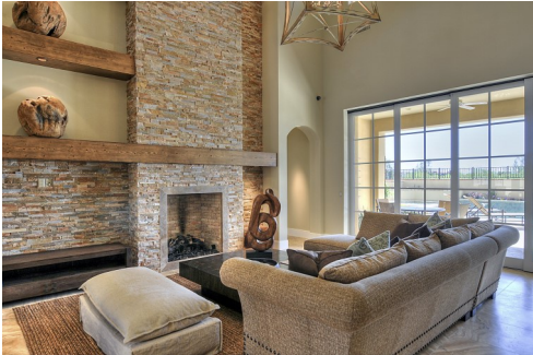
6650 N 39th Way - $1,695,000 3 bed | 3.5 bath | 3344 SF