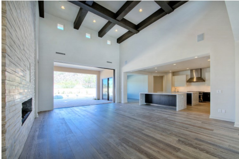
6565 N 39th Way - $1,750,000 3 bed | 3.5 bath | 3757 SF