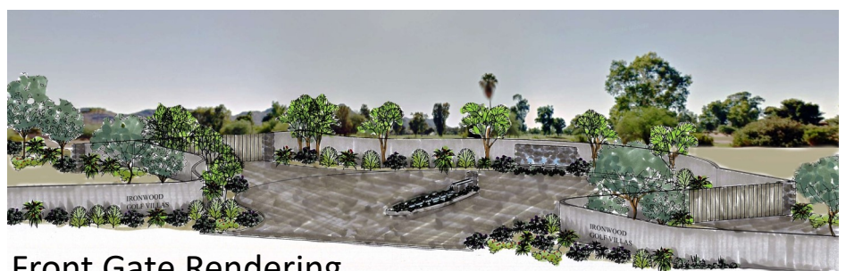
Front Gate Rendering

Disclaimer: Ironwood Golf Villas LLC/Cullum Homes reserves the right to change the above without notice. Prices are subject to change. See Purchase Agreement for details. A signed and executed Purchase Agreement will be the final Instrument of Agreement between Ironwood Golf Villas LLC and the Home Buyer. Subdivision Report has been received and will be provided upon request. Sales and Marketing provided by The Grigg's Group of Realty Executives.